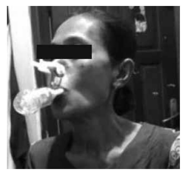
Figure 2. Patient performed inspiratory muscle training using threshold IMT